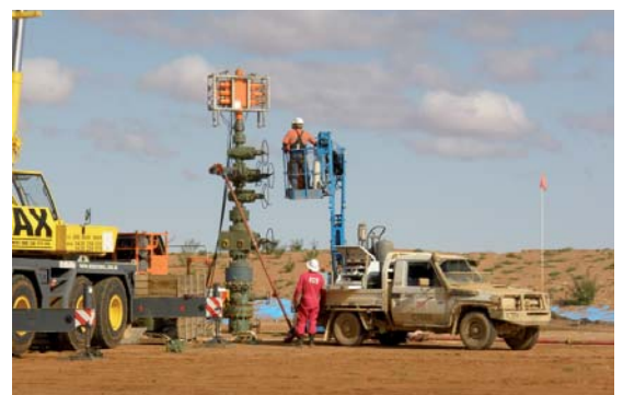
Figure 3 - Paralana 2 preparation for injectivity test