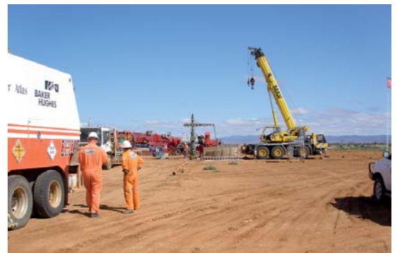
Figure 2 - Paralana 2 perforation setup