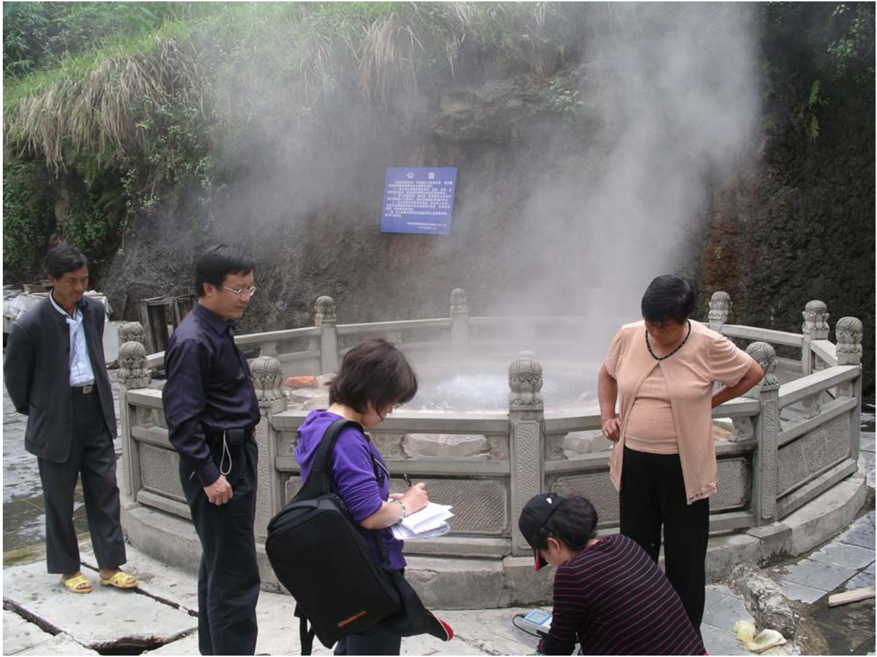
Figure 2 - Boiling Springs, Yunnan Province – China.